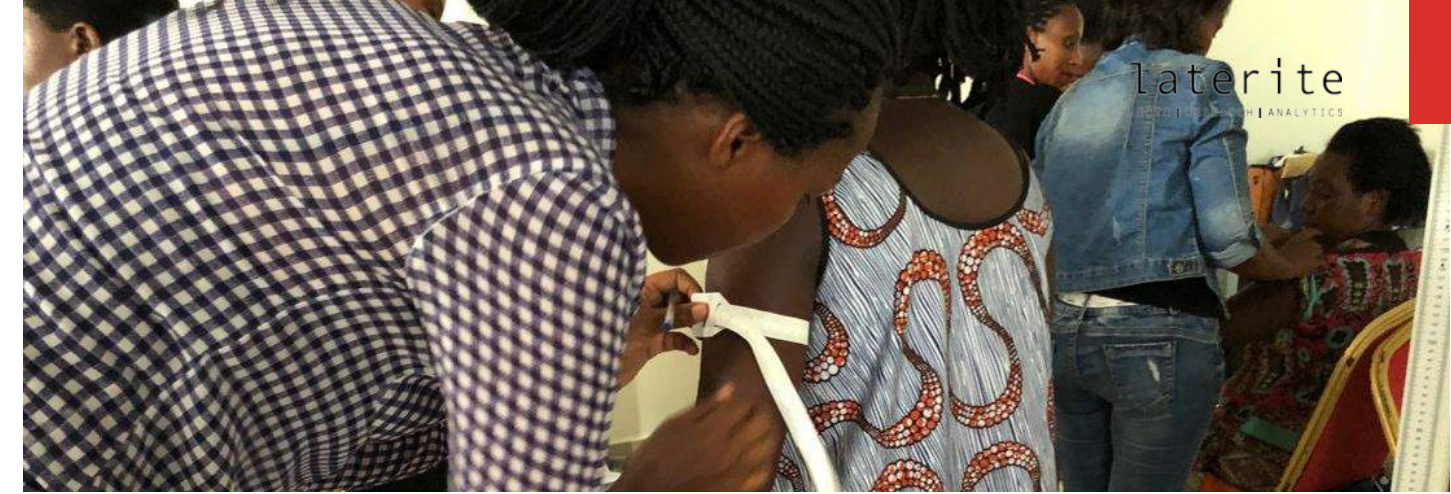
Laterite eumerators measure mid-upper arm circumference (MUAC) of mothers and babies