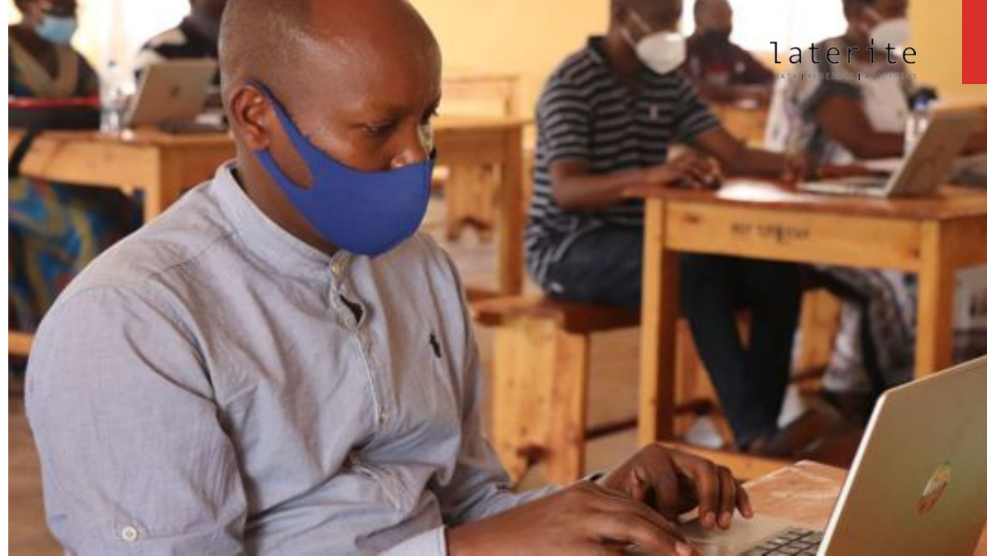
A teacher participating in continuous professional development as part of Leaders in Teaching in Rwanda.