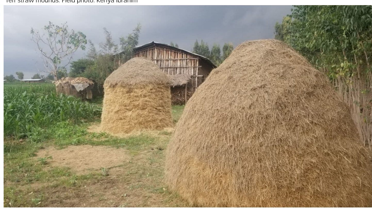
Teff straw mounds.

If money is available, farmers may also hire day laborers, at a rate of 120 to 150 birr (2.66 to 3.32 USD) per day. This is often done for weeding and for harvesting. Female-led farms are more likely to use either laborers or wonfel, as women are often labor constrained.